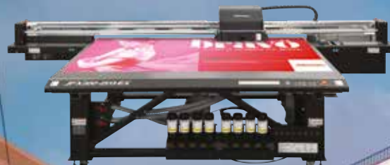
Mimaki JFX200-2513 EX